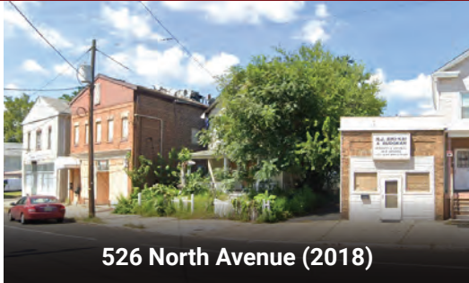
526 North Avenue (2018)