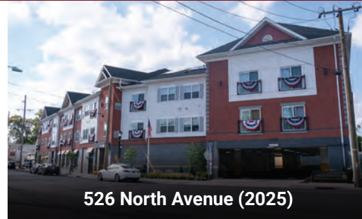
526 North Avenue (2025)