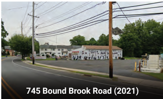
745 Bound Brook Road (2021)