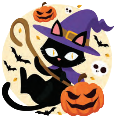
Designed by Freepik

and when you unfold the paper, you'll have a bat to decorate. Add eyes and attach string to the top of the wings to hang and display.